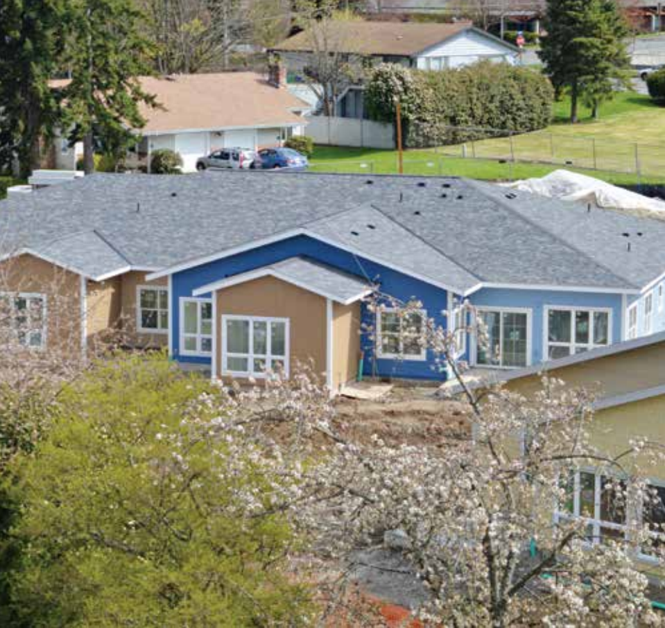
Cottage construction in progress; Rainier Bistro in The Terrace