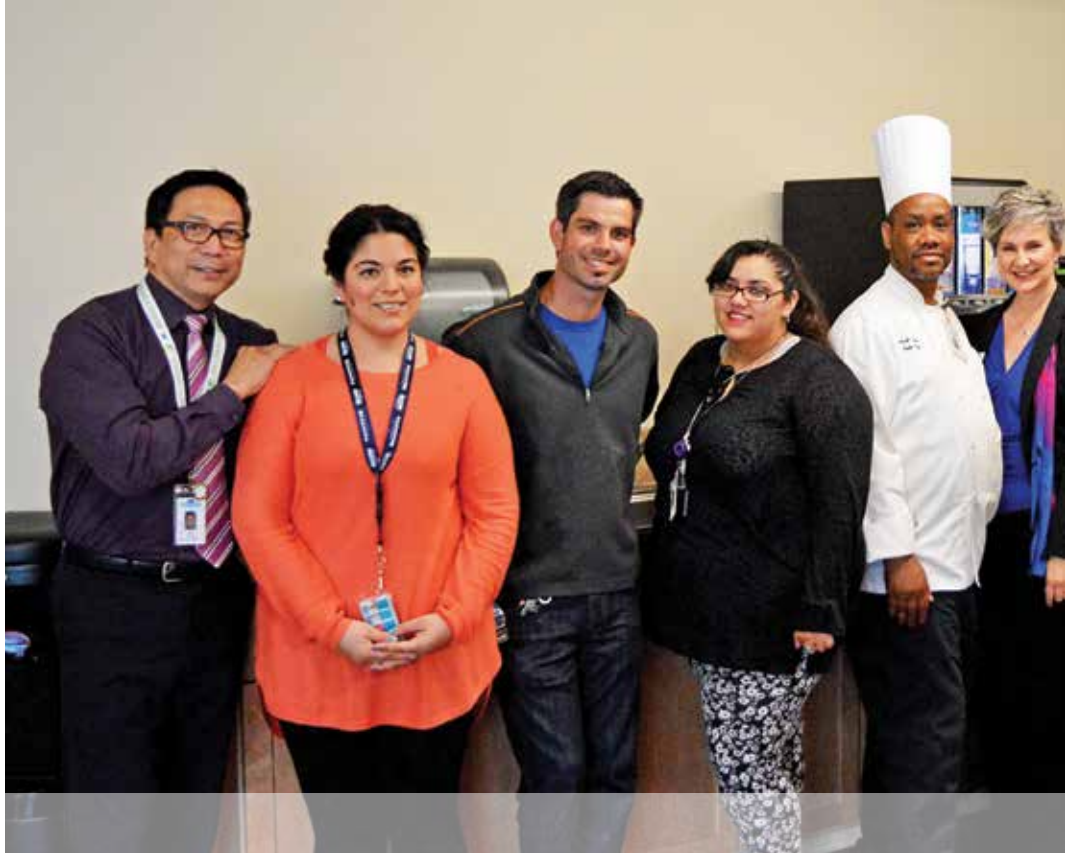
Clockwise: Staff at International Bite; Employee Lounge Remodel team; Picnic in the Meadow fidget quilt with cookies and a sandwich

“I wanted to take an opportunity to thank each and every one of the staff for their care for not only [my mother in law] but for her son, myself and her two granddaughters. It takes a whole lot of dedicated people to make a place like yours operate the way it does.”