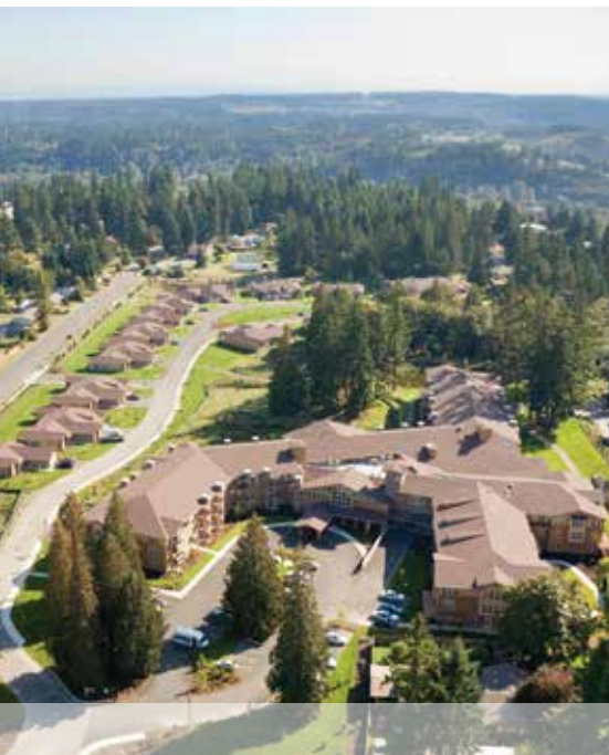
Wesley Homes Lea Hill in 2007