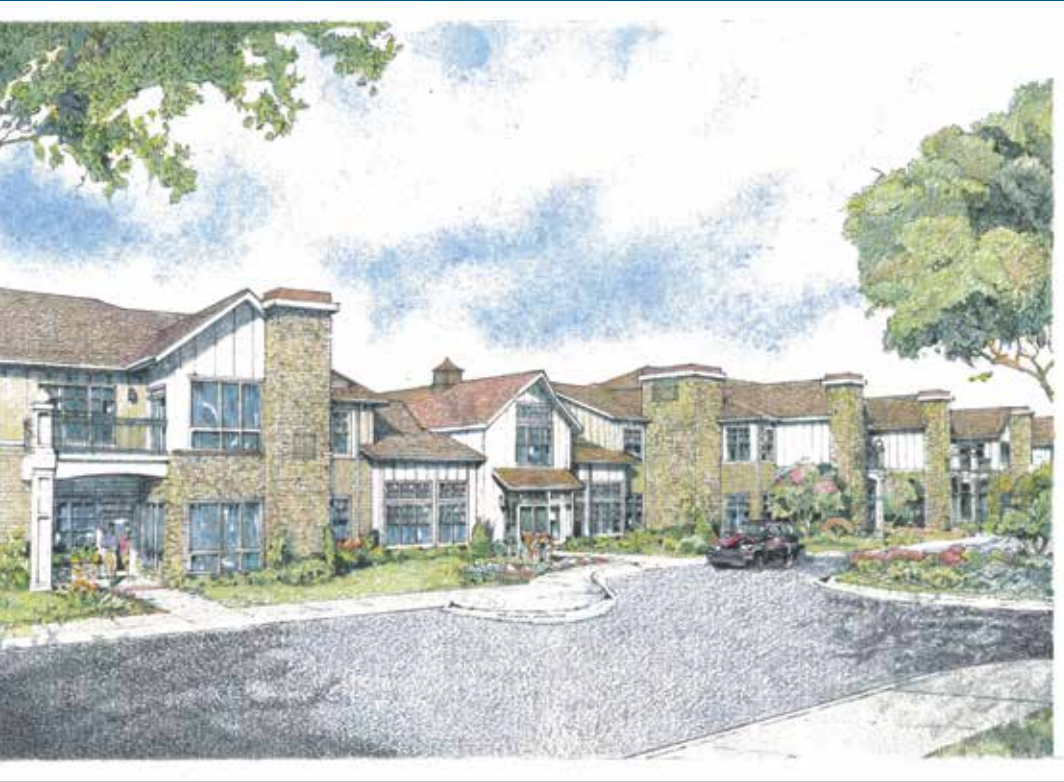
Architectural rendering of the Bradley Park Brownstone.