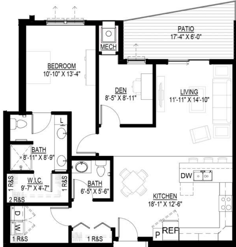
Tahoma One Bedroom Plus Den Approx. 1,081 s.f.

Sample Floor Plans SpringGlen.WesleyChoice.org