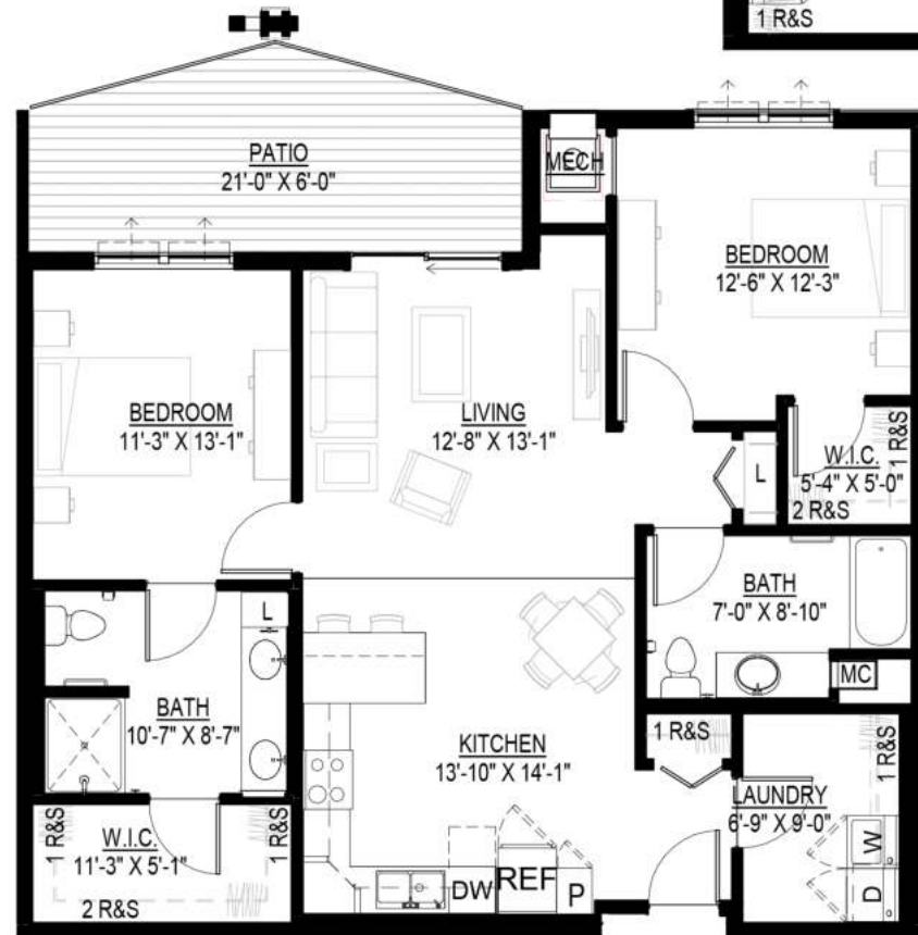
Cedar Two Bedroom Approx. 1,134 s.f.