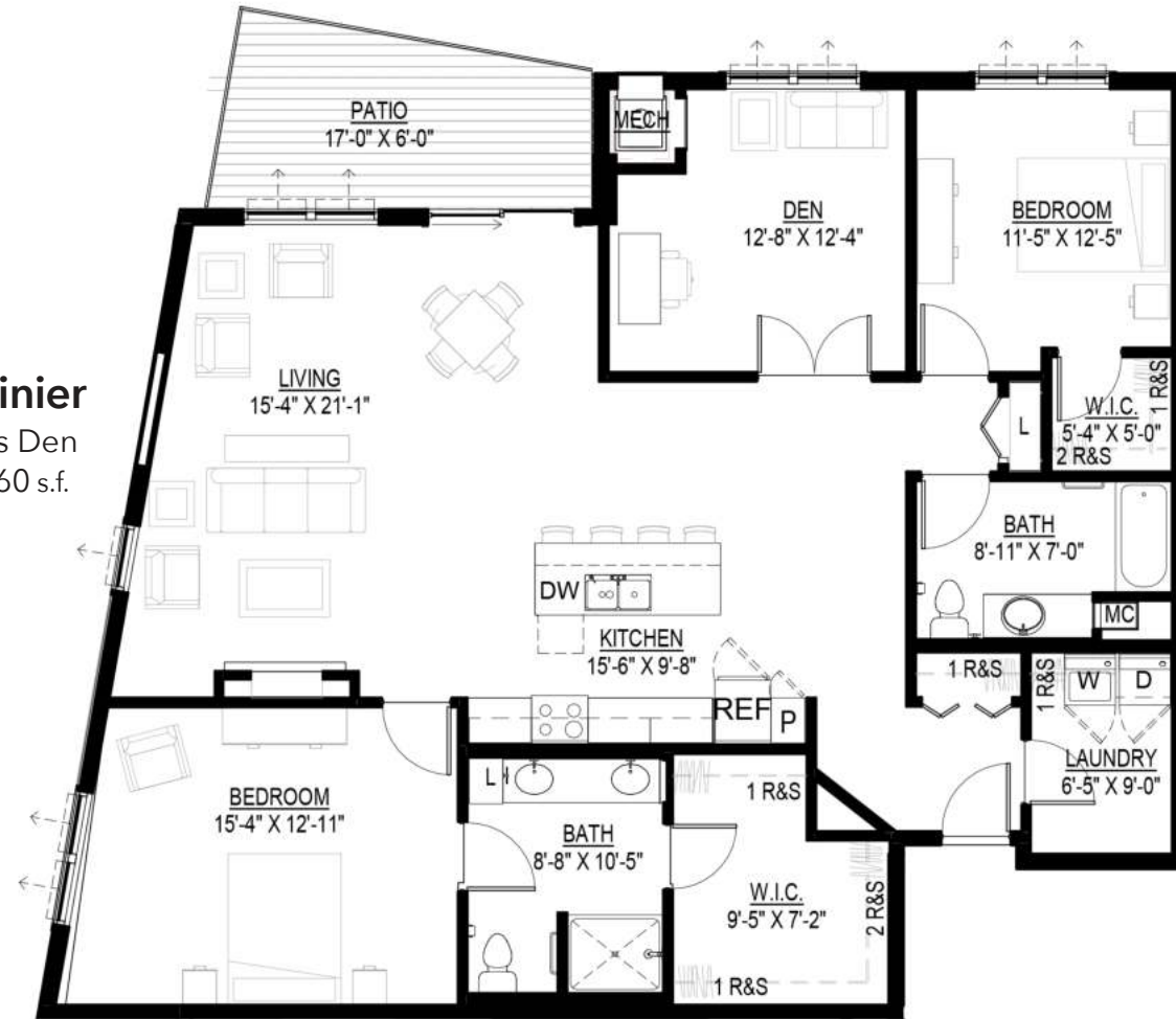
Rainier Two Bedroom Plus Den Approx. 1,660 s.f.

For more apartment plans and availability, scan the QR code with your phone or tablet. You can also visit SpringGlen.WesleyChoice.org .