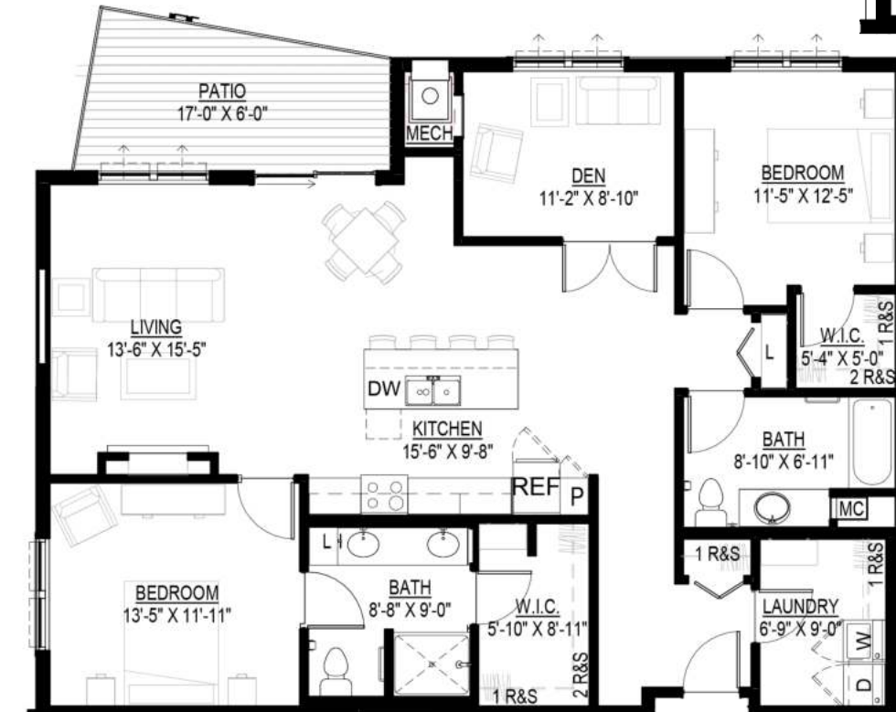
Cascade Two Bedroom Plus Den Approx. 1,407 s.f.