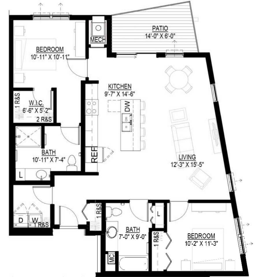
Sequoia Two Bedroom Approx. 1,152 s.f.

Sample Floor Plans SpringGlen.WesleyChoice.org