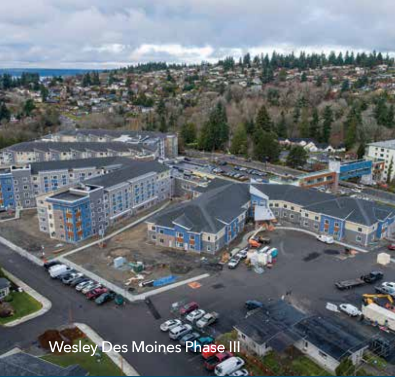
Wesley Des Moines Phase III