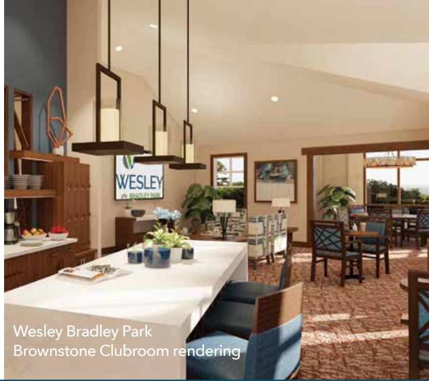
Wesley Bradley Park Brownstone Clubroom rendering