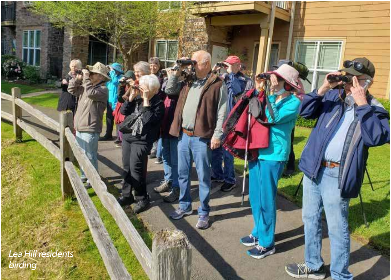
Lea Hill residents birding

Please register in advance for each class so we can send you the appropriate link and details.