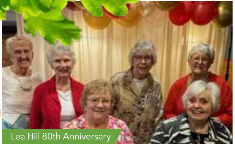
Lea Hill 80th Anniversary