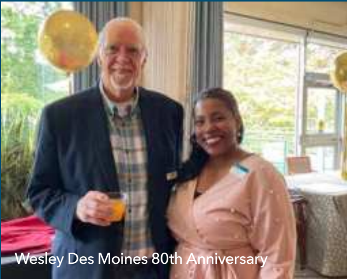
Wesley Des Moines 80th Anniversary