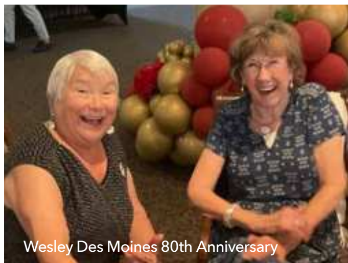
Wesley Des Moines 80th Anniversary