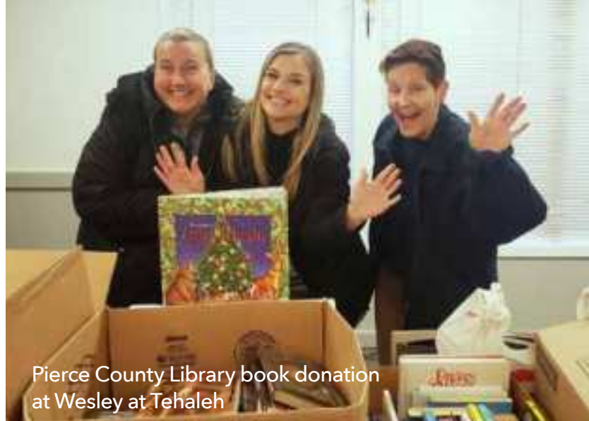
Pierce County Library book donation at Wesley at Tehaleh