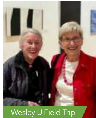
Wesley U Field Trip