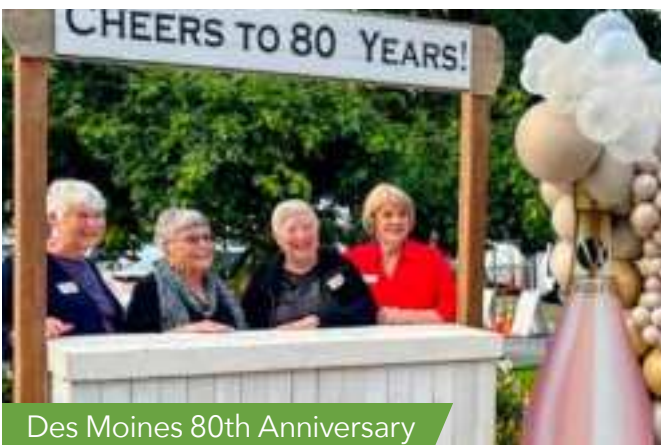
Des Moines 80th Anniversary