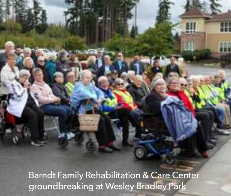
Barndt Family Rehabilitation & Care Center groundbreaking at Wesley Bradley Park