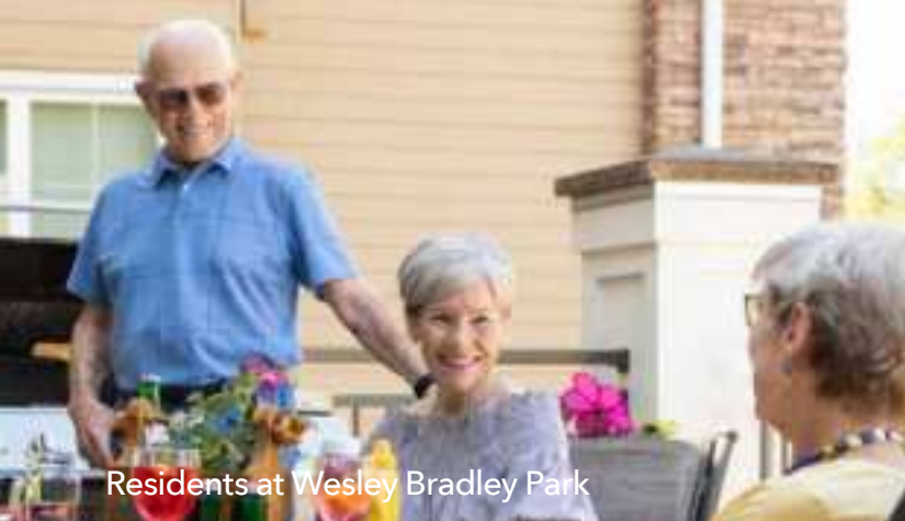
Residents at Wesley Bradley Park