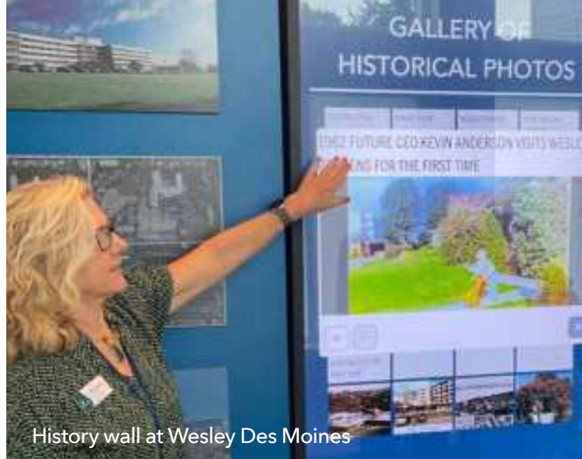
History wall at Wesley Des Moines