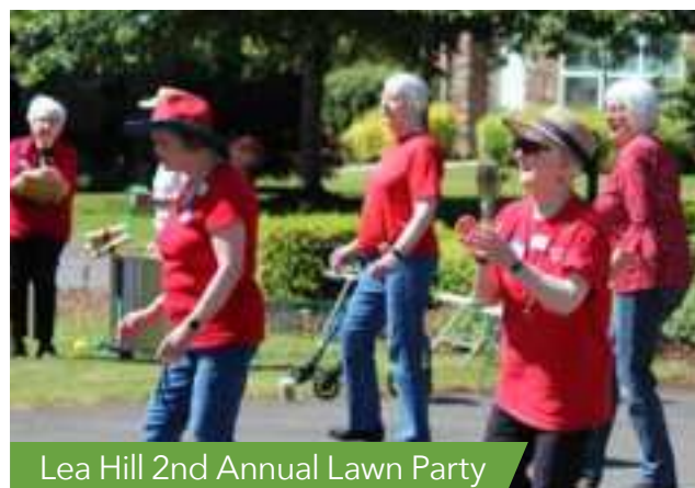
Lea Hill 2nd Annual Lawn Party