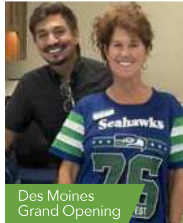
Des Moines Grand Opening