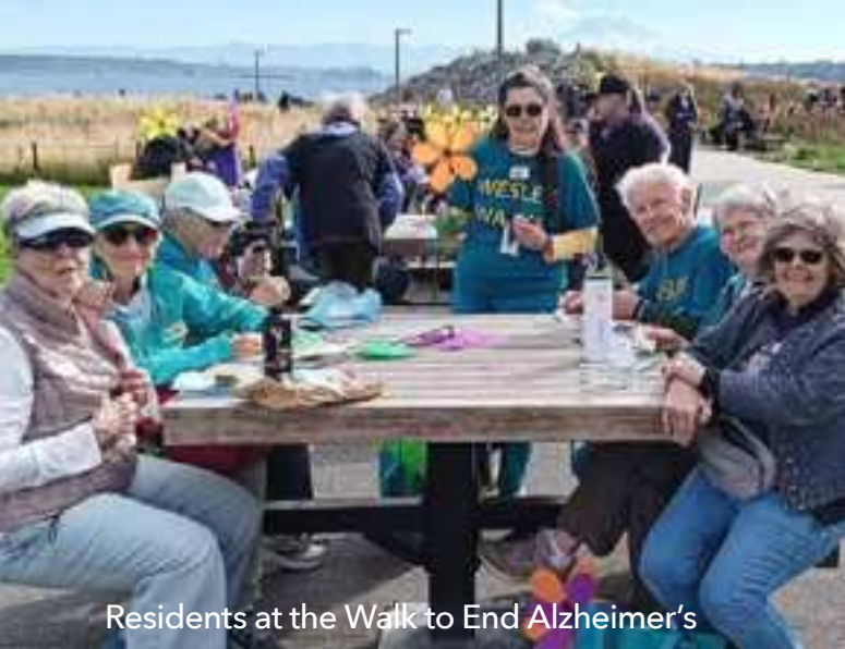
Residents at the Walk to End Alzheimer's