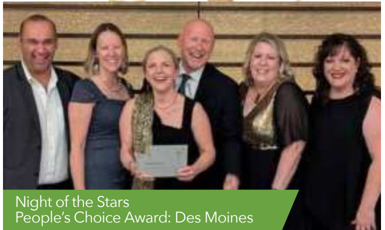
Night of the Stars People's Choice Award: Des Moines