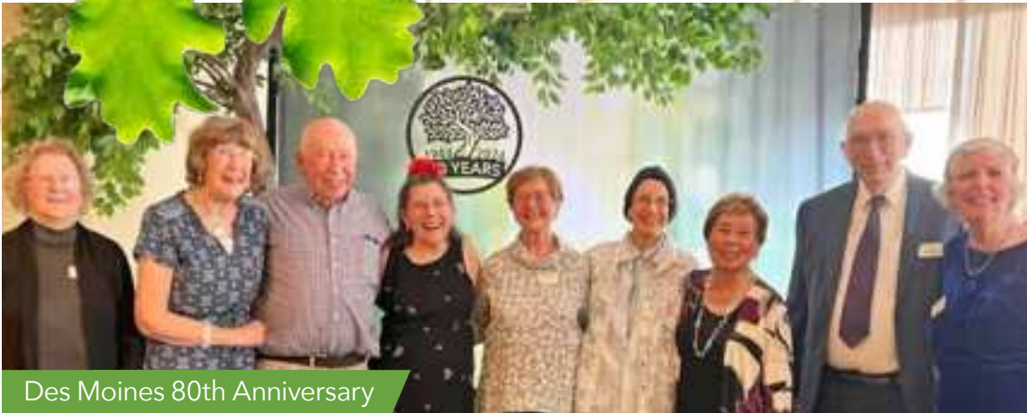
Des Moines 80th Anniversary

Celebrating the past, living the now, looking toward the future