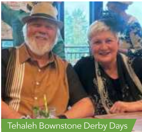
Tehaleh Bownstone Derby Days