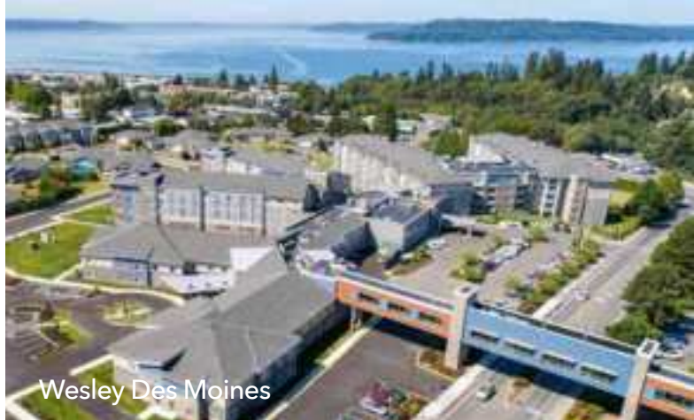
Wesley Des Moines

"My parents feel seen and cared for here. It brings us great joy to see them feel so connected."