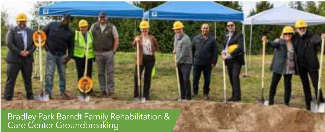
Bradley Park Barndt Family Rehabilitation & Care Center Groundbreaking