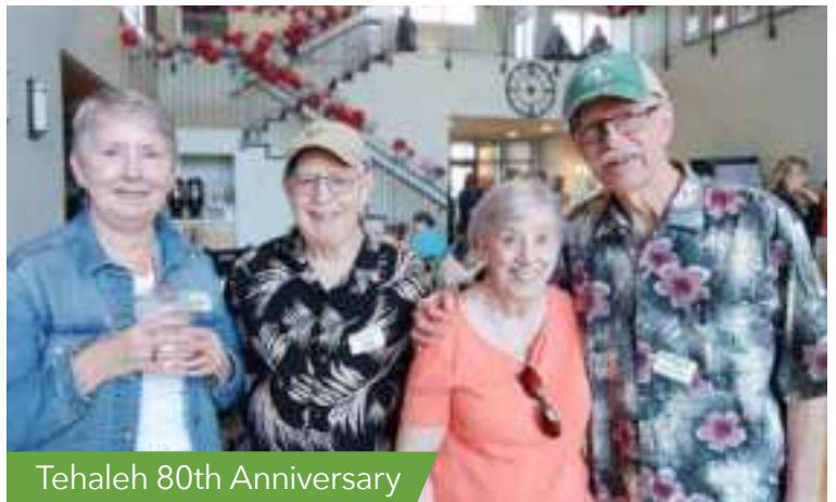
Tehaleh 80th Anniversary