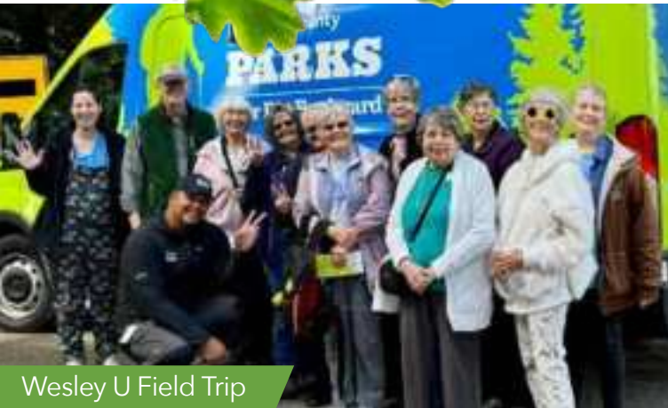
Wesley U Field Trip