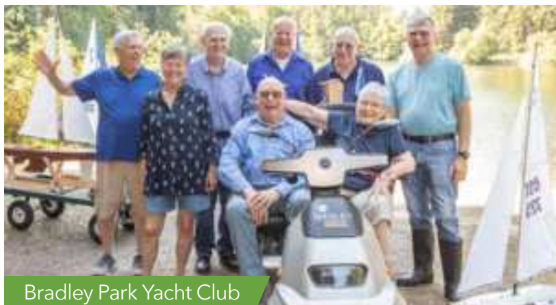
Bradley Park Yacht Club