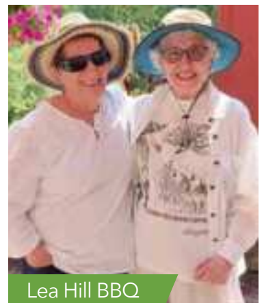
Lea Hill BBQ