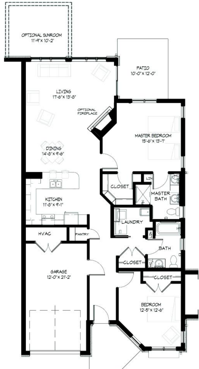
Nisqually Two Bedroom Approx. 1,370 s.f.