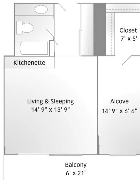
Alcove Apartment approx. 400-530 sq. ft. + Balcony 126 sq. ft.