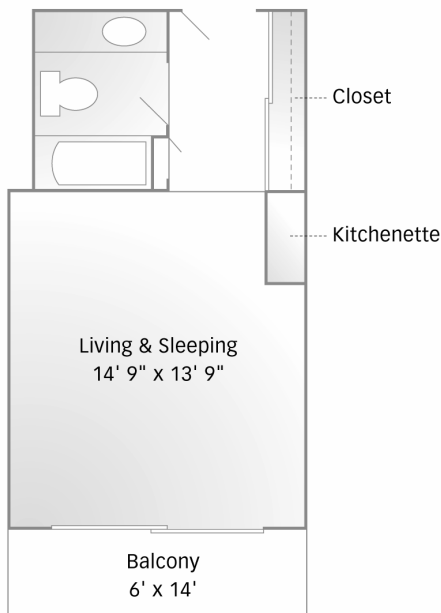
Studio Apartment approx. 300-350 sq. ft. + Balcony 84 sq. ft.